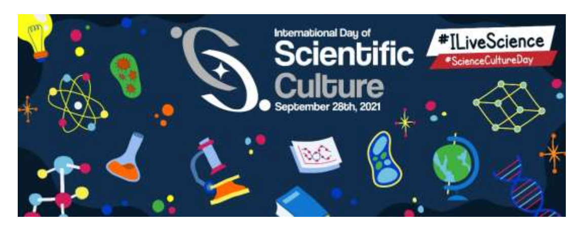
Banner for social networks (English)