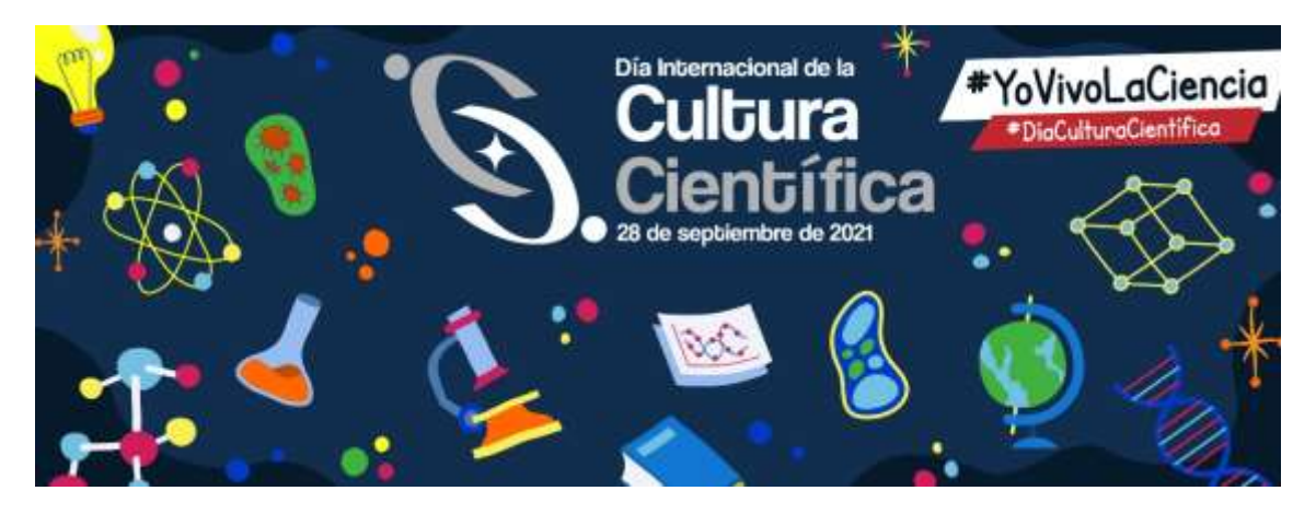
Banner for social networks (Spanish)