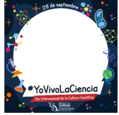
Frames for profile pictures on social networks (Spanish)